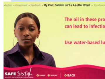
PROJECT: Safe Sistah (HIV/STD Prevention for Women) Web site CLIENT: ISA Associates