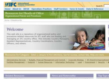
PROJECT: Resources for Heads of Office Intranet Website CLIENT: International Finance Corporation