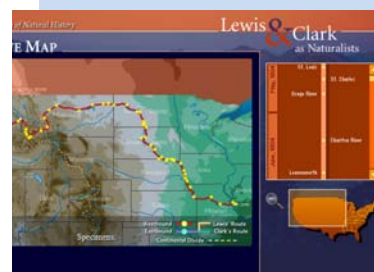
PROJECT: Lewis & Clark as Naturalists Web Site CLIENT: Smithsonian National Museum of Natural History